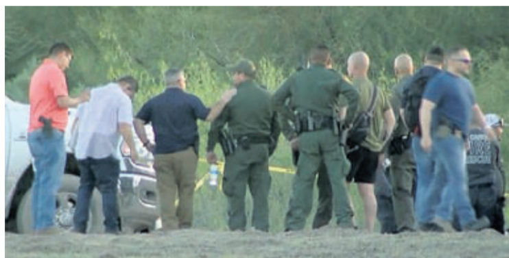
In this frame grab taken from video provided by KRGV, authorities stage near where a helicopter flying over the U.S.-Mexico border in Texas crashed, killing two National Guard soldiers and a Border Patrol agent, March 8, 2024.